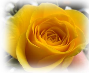
Yellow roses on every table, of course!