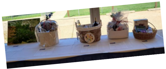
Some of the auction "loot"