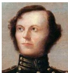
Col. James W. Fannin

Following the fall of the Alamo, the Mexican army, under the command of Gen. Santa Anna, attacked Col. James W. Fannin’s men at Goliad. Fannin was forced to surrender. On March 27 th , 320 men were executed. It was the largest loss of life in the fight for Texas’ independence.