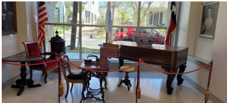
One of the "vignettes" in the RTHC. The red chair on the left belonged to Gen. Santa Anna