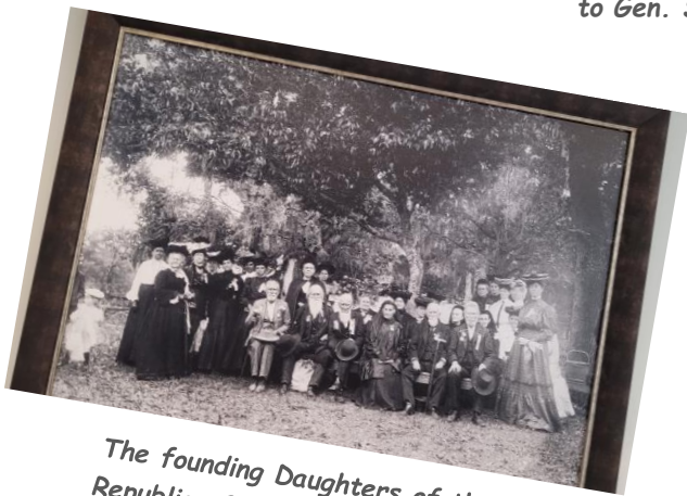
The founding Daughters of the Republic of Texas with the last veterans of the Republic of Texas Army