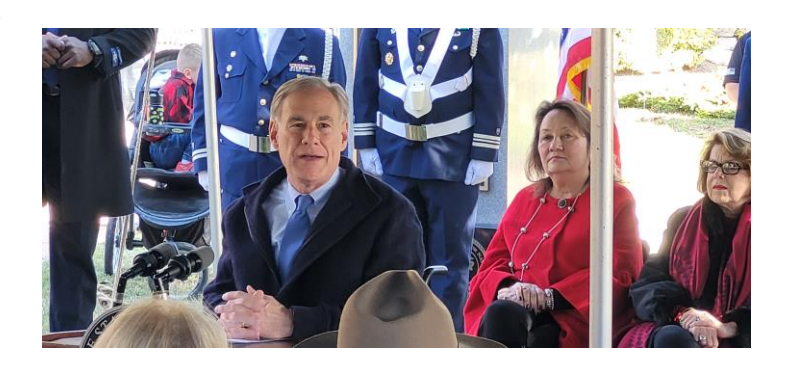
Governor Greg Abbott gave the opening remarks at the ceremony.